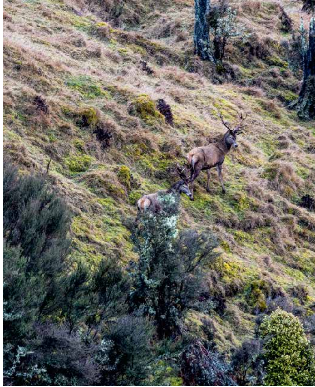
TRAIL BLAZERS The entrance to the main lodge on a winter's day. Above: Mountain-biking with Taupo's Four B, and deer at Poronui. Right: The rock carving on Lake Taupō by artist Matahi Brightwell. Opposite: Steamy hot springs at Wairakei Terraces and Thermal Health Spa.